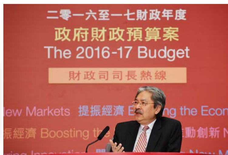
The Financial Secretary, Mr John C Tsang, attends "Financial Secretary's Budget Phone-in" to explain to the public about Budget measures.

“Hong Kong should act swiftly to identify new development opportunities as a result of a new economic order being driven by breakthroughs in information technology (IT) and the increasingly influential role of emerging markets in the global economy.”