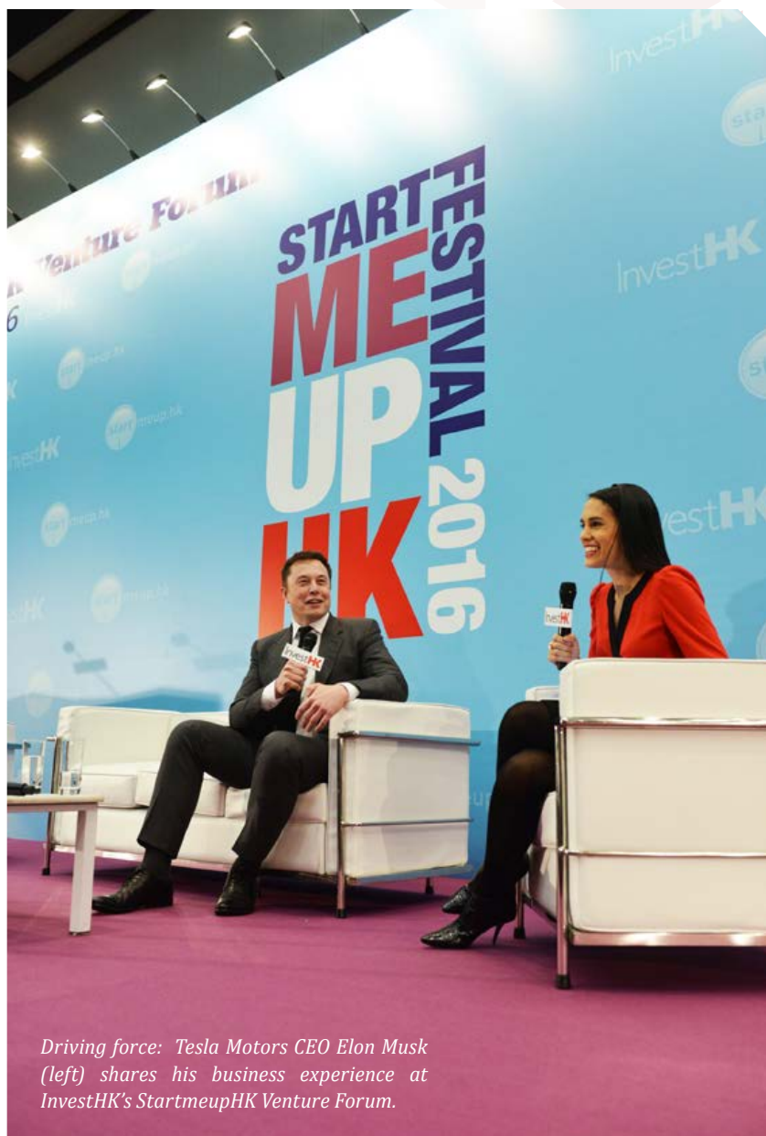
Driving force: Tesla Motors CEO Elon Musk (left) shares his business experience at InvestHK's StartmeupHK Venture Forum.

"Many entrepreneurs think that Hong Kong is really only for big businesses, that you've got to be a big bank or a big Fortune 50 company to be able to afford to have an office here in Hong Kong. But that's not really true. Because we've seen such a huge increase in the number of co-working spaces, there is more supply than demand and so if you're a founder or an entrepreneur, you can rent a seat in a co-working space much cheaper than you could in London or Silicon Valley or many other parts of the world."