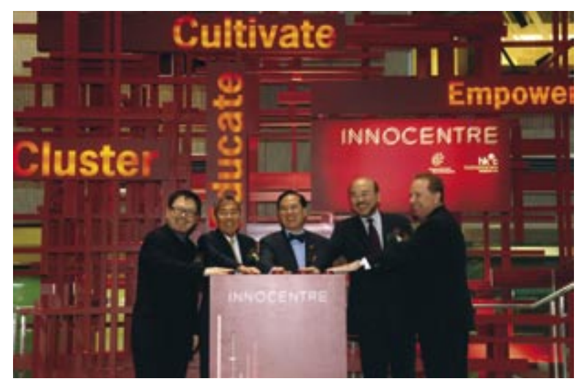
CE Donald Tsang (middle), SCIT Joseph Wong (second from left) and other officiating guests perform a lighting ceremony of the InnoCentre.

To make the InnoCentre a magnet for design activities, the Government has earmarked an additional HK$100 million to support the Hong Kong Design Centre over the coming five years. This will help the centre to hold exhibitions, conferences, workshops, networking functions and professional education and training courses. \Diamond