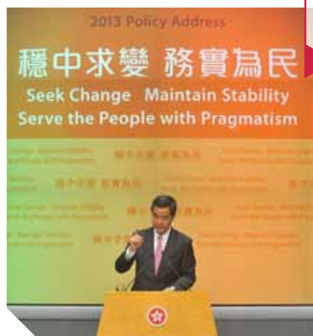
THE CHIEF EXECUTIVE AT A PRESS CONFERENCE ON THE POLICY ADDRESS.