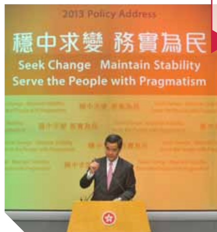
THE CHIEF EXECUTIVE AT A PRESS CONFERENCE ON THE POLICY ADDRESS.