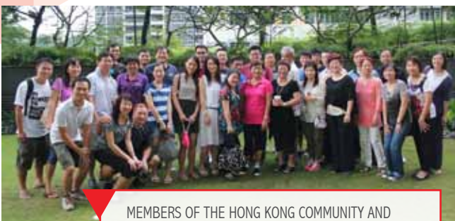
MEMBERS OF THE HONG KONG COMMUNITY AND COLLEAGUES OF HKETO (ASEAN) IN A GROUP PHOTO