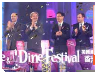
THE FINANCIAL SECRETARY, MR JOHN C TSANG (SECOND LEFT), OFFICIATES WITH OTHER GUESTS AT THE OPENING OF THE WINE AND DINE FESTIVAL IN HONG KONG.

The Wine and Dine event was organised in partnership with the Hong Kong Tourism Board as a prelude to the Wine and Dine Month in Hong Kong in November.