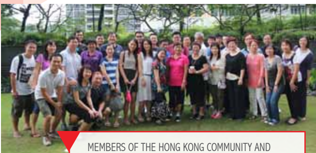
MEMBERS OF THE HONG KONG COMMUNITY AND COLLEAGUES OF HKETO (ASEAN) IN A GROUP PHOTO