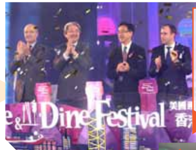
THE FINANCIAL SECRETARY, MR JOHN C TSANG (SECOND LEFT), OFFICIATES WITH OTHER GUESTS AT THE OPENING OF THE WINE AND DINE FESTIVAL IN HONG KONG.

The Wine and Dine event was organised in partnership with the Hong Kong Tourism Board as a prelude to the Wine and Dine Month in Hong Kong in November.