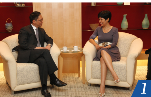
1 The Secretary for Justice, Mr Rimsky Yuen, SC (left), meets Singapore's Senior Minister of State of the Ministry of Law, Ms Indranee Rajah.