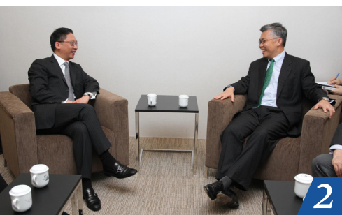
2 Mr Yuen (left) meets Singapore's Attorney-General, Mr Steven Chong Horng Siong, SC (right).

The Secretary for Justice, Mr Rimsky Yuen, SC, visited Singapore from April 2 to 3 to promote Hong Kong as a legal services hub and a dispute resolution centre in the Asia Pacific Region, and to enhance ties with Singapore's legal sector.