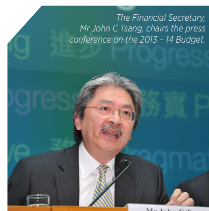
The Financial Secretary, Mr John C Tsang, chairs the press conference on the 2013 - 14 Budget.

For full details of the 2013 - 14 Budget, please visit www.budget.gov.hk .