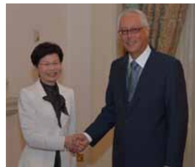
Mrs Lam (left) calls on the Emeritus Senior Minister of Singapore, Mr Goh Chok Tong (right).

Mrs Lam also spoke on "socio-economic issues faced by Asian economies from a Hong Kong perspective" at a luncheon talk co-organised by the HKETO(ASEAN) and the Singapore Institute of International Affairs.