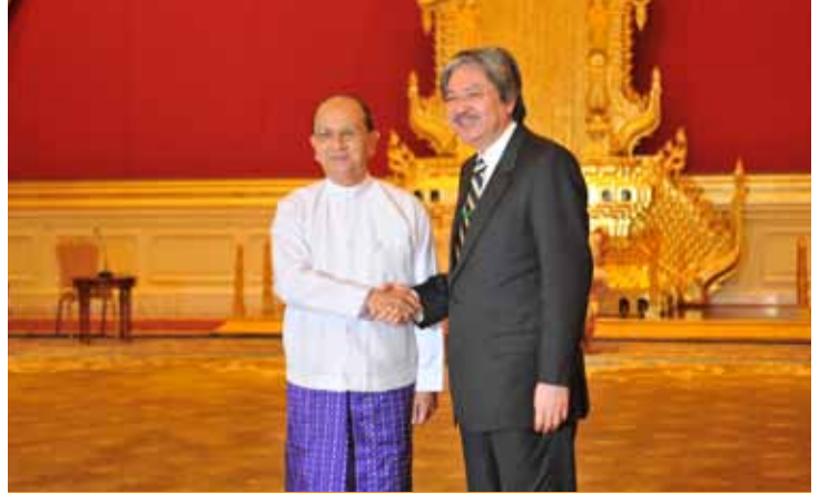
Mr Tsang (right) calls on the President of Myanmar, Mr Thein Sein.

The Financial Secretary, Mr John C Tsang, led a high-level delegation of some 20 members from Hong Kong's business, professional and financial services sectors to visit Cambodia and Myanmar in June to promote trade flows and economic development between Hong Kong and these two countries with a view to further tapping into the emerging Southeast Asian market.