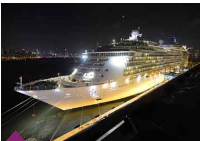
The first cruise liner, Mariner of The Seas, berths at Kai Tak Cruise Terminal.

He said, "There is of course a lot more we should and could do to make this new terminal a success. The Government, the terminal operator and our travel industry will work hard together to achieve this goal."