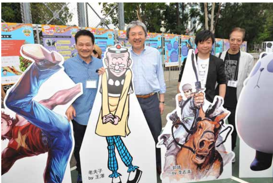
The Financial Secretary, Mr John C Tsang (second left), officiates at opening ceremony of Hong Kong Ani-Com Summer 2013.

"Since 2009, CreateHK has sponsored HK$55 million for over 40 projects that are conducive to the development of the industry through the CreateSmart Initiative," he said.