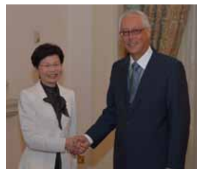
Mrs Lam (left) calls on the Emeritus Senior Minister of Singapore, Mr Goh Chok Tong (right).

Mrs Lam also spoke on "socio-economic issues faced by Asian economies from a Hong Kong perspective" at a luncheon talk co-organised by the HKETO(ASEAN) and the Singapore Institute of International Affairs.