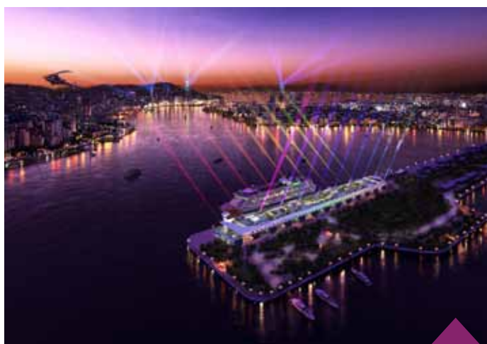
An artistic impression of the night view of the Kai Tak Cruise Terminal.