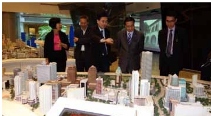
The Secretary for Transport and Housing, Professor Anthony Cheung (second right) tours the Urban Redevelopment Authority City Gallery.

The Secretary for Transport and Housing, Professor Anthony Cheung, visited Singapore from May 13 to 15.