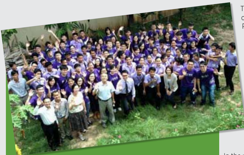
Guests and students at the opening of the joint training session of the Capacity Building Project in Phnom Penh, Cambodia.