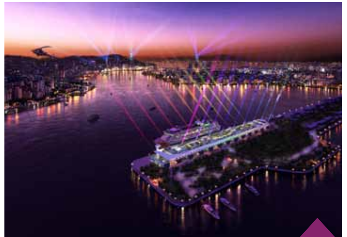
An artistic impression of the night view of the Kai Tak Cruise Terminal.