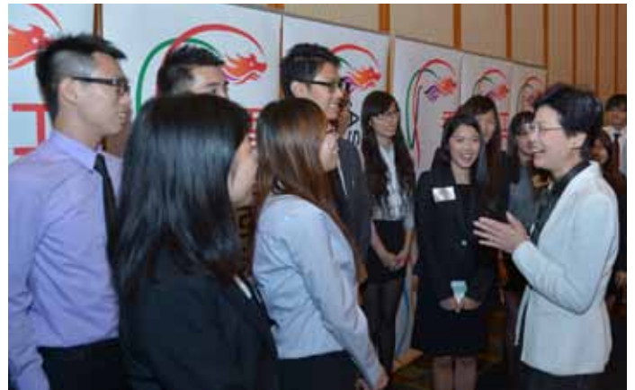
The Chief Secretary for Administration, Mrs Carrie Lam (far right), meets with university students from Hong Kong who are undertaking internship programmes in Singapore.

“I gained satisfaction through contributing to the office with my knowledge and skills. Meanwhile, working with people from different backgrounds is fascinating to me, especially in a country with cultural diversities and a multi-lingual environment. With all these, I gained a fruitful and unforgettable internship in Singapore.”