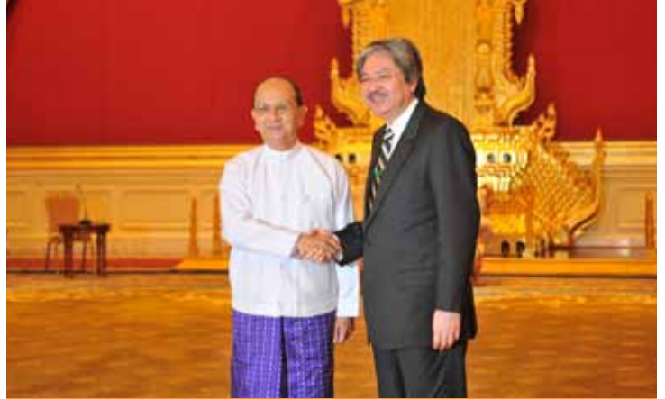
Mr Tsang (right) calls on the President of Myanmar, Mr Thein Sein.

The Financial Secretary, Mr John C Tsang, led a high-level delegation of some 20 members from Hong Kong's business, professional and financial services sectors to visit Cambodia and Myanmar in June to promote trade flows and economic development between Hong Kong and these two countries with a view to further tapping into the emerging Southeast Asian market.