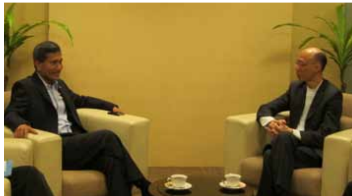
The Secretary for the Environment, Mr Wong Kam-sing (right) meets with the Minister for the Environment and Water Resources, Dr Vivian Balakrishnan.

The Secretary for the Environment, Mr Wong Kam-sing, led a delegation to Singapore from May 15 to 17 to study its latest developments in green building, energy efficiency and waste management. The delegation comprised members of the Steering Committee on the Promotion of Green Building.