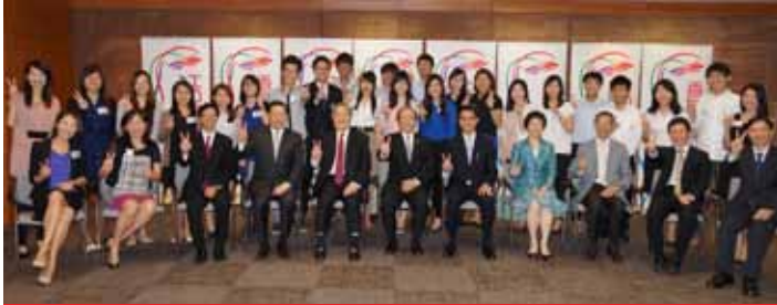
During a visit to Singapore in July, the Secretary for Education, Mr Eddie Ng Hak-kim (centre, front row), meets a group of university students from Hong Kong undertaking internships in Singapore. He also announced the launch of the ASEAN Internship for University Students of Hong Kong Scheme at the event.

As part of the efforts to enhance bilateral relations between ASEAN and Hong Kong, the HKETO(ASEAN) has developed an ASEAN Internship for University Students of Hong Kong Scheme (the Scheme) to be officially launched in summer 2014. HKETO(ASEAN)