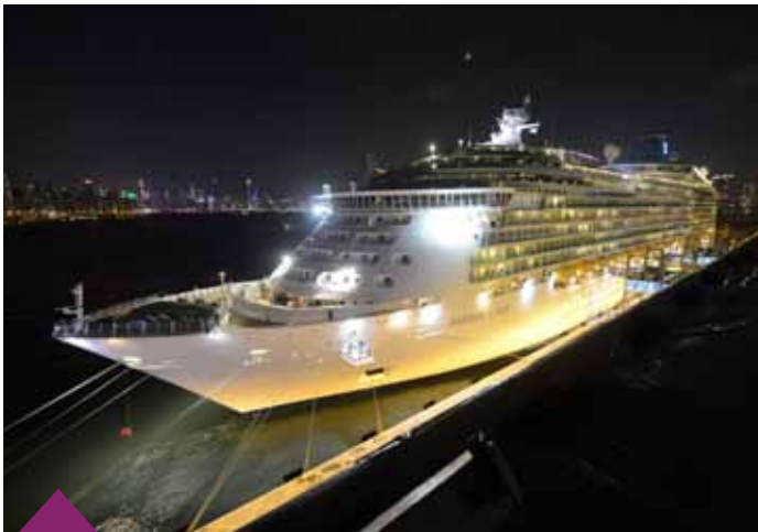
The first cruise liner, Mariner of The Seas, berths at Kai Tak Cruise Terminal.

He said, "There is of course a lot more we should and could do to make this new terminal a success. The Government, the terminal operator and our travel industry will work hard together to achieve this goal."