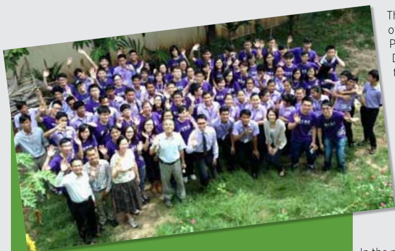
Guests and students at the opening of the joint training session of the Capacity Building Project in Phnom Penh, Cambodia.