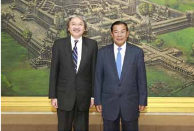
The Financial Secretary, Mr John C Tsang (left), calls on the Prime Minister of Cambodia, Mr Hun Sen.