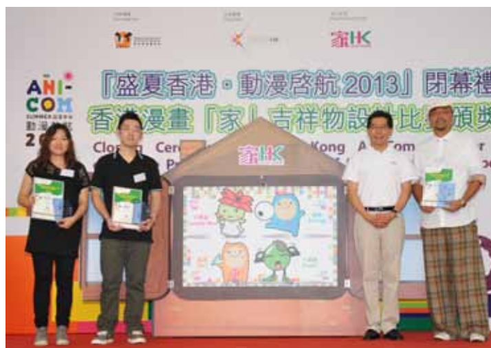
The champions of the Mascot Design Competition with the Secretary for Commerce and Economic Development, Mr Gregory So (second right), at the closing ceremony on August 31.

Animation Filmmaker Society, the Hong Kong Arts Centre, the Hong Kong Comics and Animation Federation and the Hong Kong Digital Entertainment Association as co-organisers.