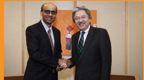
Mr Tsang (right) meets with the Deputy Prime Minister and Minister for Finance, Mr Tharman Shanmugaratnam.