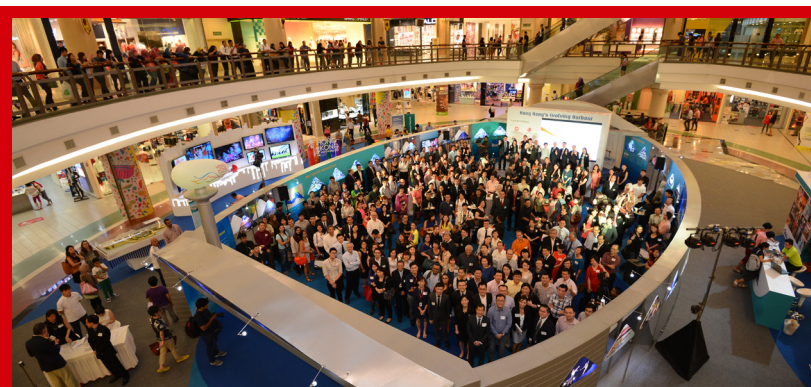
The design of the exhibition venue is inspired by the Kai Tak Cruise Terminal.