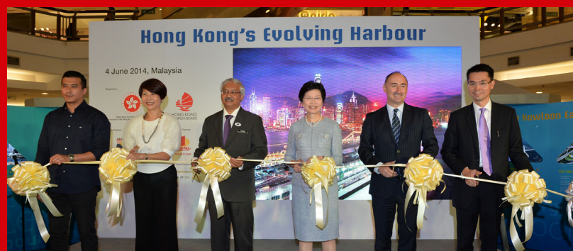
The Chief Secretary for Administration, Mrs Carrie Lam (third right) and other officiating guests at the ribbon-cutting ceremony for the Hong Kong's Evolving Harbour Exhibition cum Travel Fair.