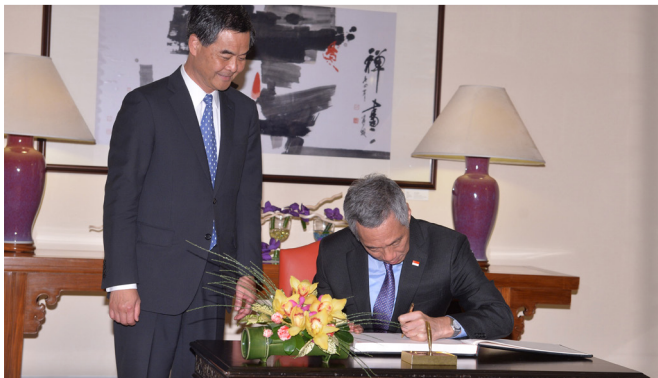
The Prime Minister of Singapore, Mr Lee Hsien Loong, signs the guest book at Government House.

The Chief Executive, Mr C Y Leung, received the visiting Prime Minister of Singapore, Mr Lee Hsien Loong, at Government House in Hong Kong on September 17.