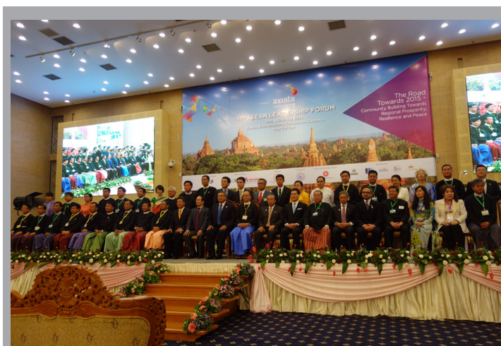
Secretary for Commerce and Economic Development, Mr Gregory So (eighth right, front row), is pictured with leaders and senior government officials of members of the ASEAN as well as representatives of the organisers of the ASEAN Leadership Forum at the welcome dinner. Tenth from right on the front row is the President of Myanmar, Mr Thein Sein, and eleventh from right on the front row is the President of the Republic of Indonesia, Dr H Susilo Bambang Yudhoyono.

forum held alongside the Summit of ASEAN Leaders.