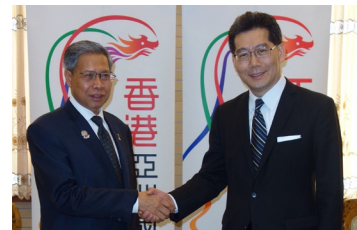
Mr So (right) meets with Minister of International Trade and Industry of Malaysia, Dato' Sri Mustapa Mohamed.

The Secretary for Commerce and Economic Development, Mr Gregory So, said the ASEAN Economic Community (AEC) would facilitate ASEAN members in the process of regional integration in the context of other ongoing free trade and economic partnership agreements.