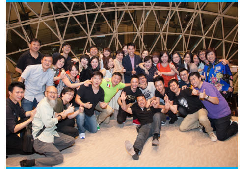
A light moment for members of the Hong Kong Chinese Orchestra after the concert with Mr Fong.