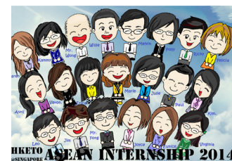
Four university students who took up internships in the HKETO in the inaugural round of the ASEAN internship scheme prepared a special card showing all faces in the office.