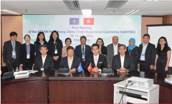
The Secretary for Commerce and Economic Development, Mr Gregory So (first row, second right), in a group photo with the participants of the meeting.

The first round of negotiation on the Free Trade Agreement (FTA) between Hong Kong and ASEAN was held successfully on July 11.