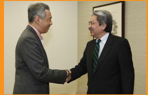
The Financial Secretary Mr John C Tsang (right), is greeted by the Prime Minister, Mr Lee Hsien Loong.