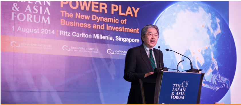
Mr Tsang delivers a keynote speech at the 7th ASEAN and Asia Forum in Singapore.

The Financial Secretary, Mr John C Tsang, promoted Hong Kong's multiple roles as the gateway to China, a global business centre, a global financial centre and a global aviation and logistics centre during his recent visit to Singapore.