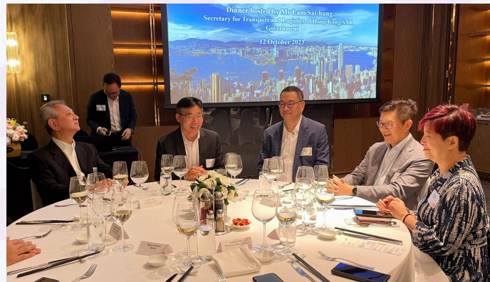
Dinner with Hong Kong Business Association Vietnam