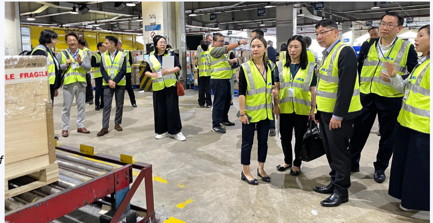
Visiting logistics facilities located near Noi Bai International Airport