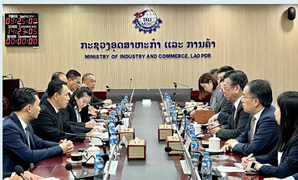
Meeting with Minister of Industry and Commerce of Laos, Mr Malaithong Kommasith (second left).

The Secretary for Commerce and Economic Development, Mr Algernon Yau, and the Secretary for Financial Services and the Treasury, Mr Christopher Hui, visited Laos from December 11 to 12. Mr Hui further visited Vietnam from December 12 to 15. The visit was to update the Laotian and Vietnamese government and business communities on opportunities in Hong Kong and the Guangdong-Hong Kong-Macao Greater Bay Area, promote Hong Kong's financial, commercial and professional services, and explore collaboration between Hong Kong and the two countries on different fronts. Laos will assume the ASEAN chairmanship in 2024.