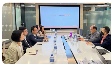
Meeting with SkillsFuture's team.