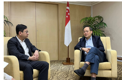
The Secretary for Labour and Welfare Mr Chris Sun with Minister for Manpower of Singapore, Dr Tan See Leng (right).