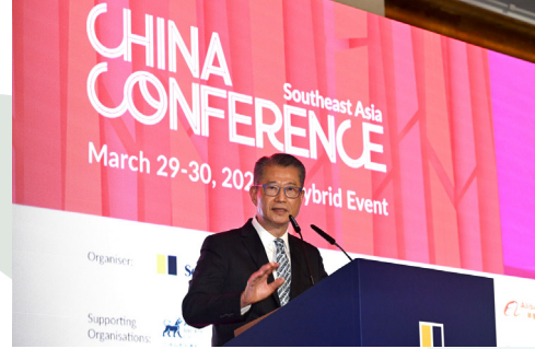
The Financial Secretary, Mr Paul Chan, spoke at the China Conference: Southeast Asia 2023 .