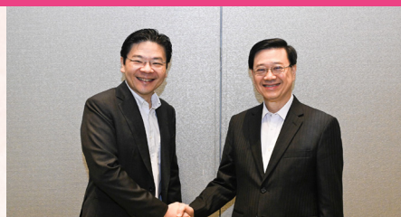
Meeting with Deputy Prime Minister Mr Lawrence Wong (left)