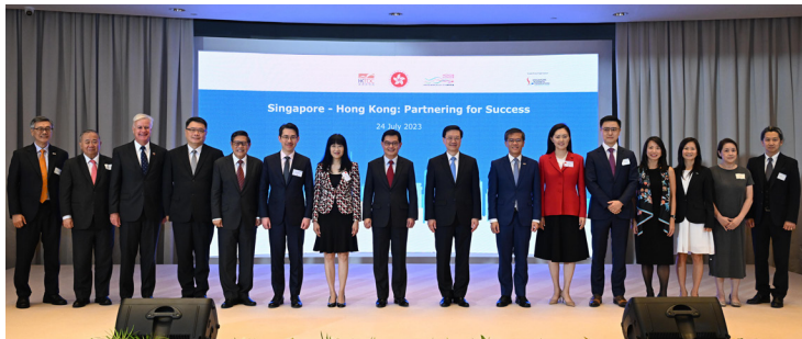
Enterprises and institutions of HK and Singapore signed 7 memoranda of understanding (MoU) on areas including trade, financial services, fintech, innovation and technology, and research collaboration during CE's visit.