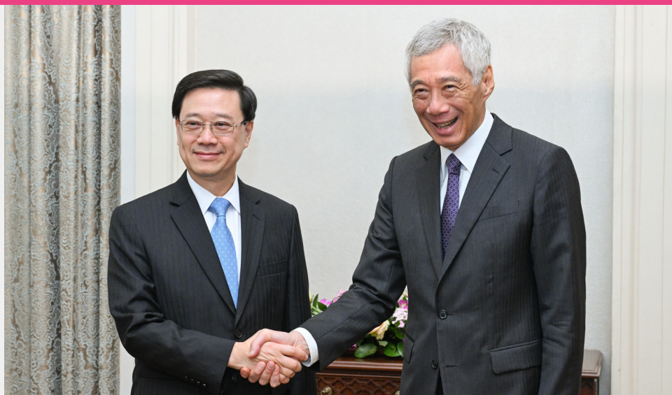
The Chief Executive Mr John Lee meeting with Prime Minister of Singapore, Mr Lee Hsien Loong (right)

Hong Kong and Singapore share the same cosmopolitan characteristics, rooted in Asian culture and values. Hong Kong is known for its "Lion Rock Spirit", the can-do attitude and the perseverance of our resilient people. Singapore is renowned as a Lion City for its courage, strength and excellence. We are two valiant, nimble and fast-paced lions from the East, with a wide world of opportunities ahead of us.