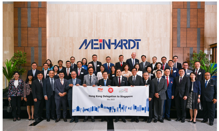
The delegation visited a major Singaporean enterprise Meinhardt, noting that its success in using Hong Kong as a springboard to tap the Mainland market could inspire other Singaporean and ASEAN enterprises to follow suit.