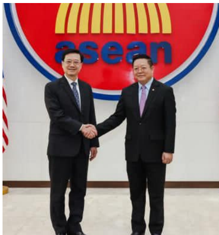
Mr John Lee met with the Secretary-General of ASEAN, Dr Kao Kim Hourn (right). ASEAN has long been HK's second-largest trading partner. Mr Lee thanked ASEAN member states for supporting HK's accession to the RCEP, and looked forward to maintaining close communication with the ASEAN Secretariat on relevant issues.