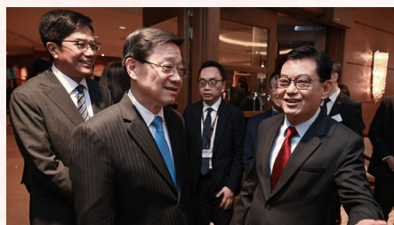
Meeting with Deputy Prime Minister Mr Heng Swee Keat (right)