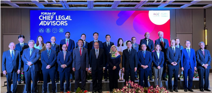
Attendance at the inaugural Forum of Chief Legal Advisors organised by the Attorney-General's Chambers of Singapore.