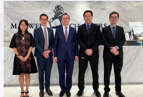
Visit to Maxwell Chambers to exchange views on integrated facilities and services on alternative dispute resolution.