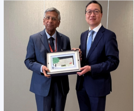
Presentation of souvenir to the Attorney General of India, Mr R Venkataramani (left).