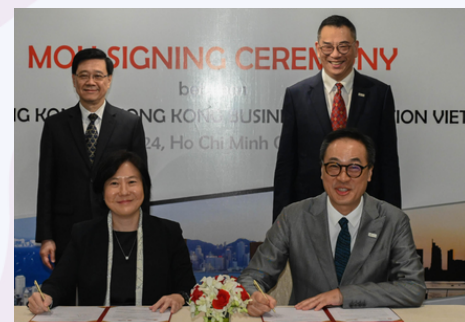
Signing of MoU between InvestHK and Hong Kong Business Association Vietnam.