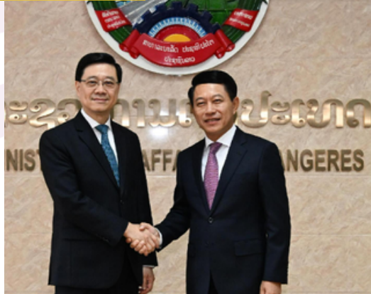
Meetings with Lao Prime Minister Mr Sonexay Siphandone (left photo) and Deputy Prime Minister and Minister of Foreign Affairs Mr Saleumxay Kommasith (right photo) respectively.