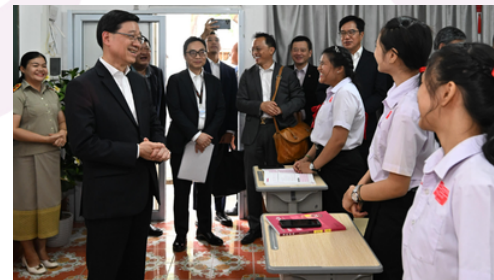
Visit to Vientiane Secondary School, a leading public school in Laos.