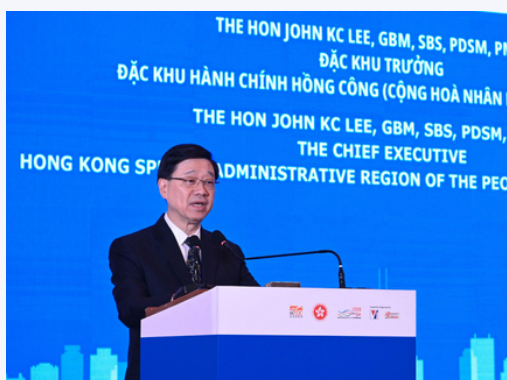
A business luncheon in Ho Chi Minh City.