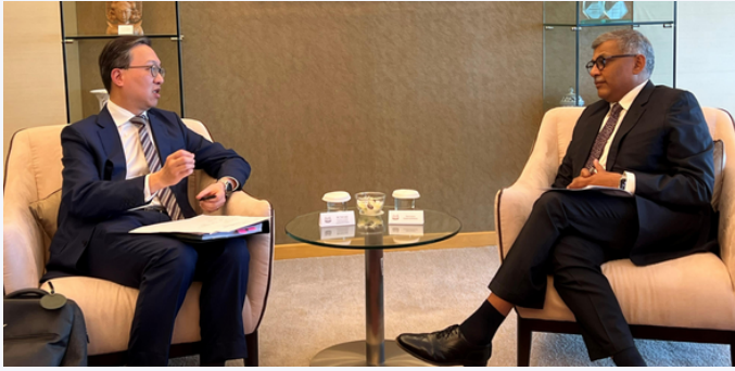
Meeting with the Chief Justice of the Supreme Court of Singapore, Mr Sundaresh Menon (right).

The Secretary for Justice, Mr Paul Lam, visited Singapore from July 24 to 26. He attended the inaugural Forum of Chief Legal Advisors organised by the Attorney-General's Chambers of Singapore to discuss topics including international investment dispute settlements, and promote the advantages and opportunities of Hong Kong's legal services to other forum participants. He also attended the 125th Anniversary Commemorative Event of the Permanent Court of Arbitration (PCA). During his stay, he took the opportunity to meet Chief Justice of the Supreme Court of Singapore, Mr Sundaresh Menon, as well as the Attorney General of India, Mr R Venkataramani, to discuss matters of mutual interest, and visited the Singapore Academy of Law and the Maxwell Chambers.