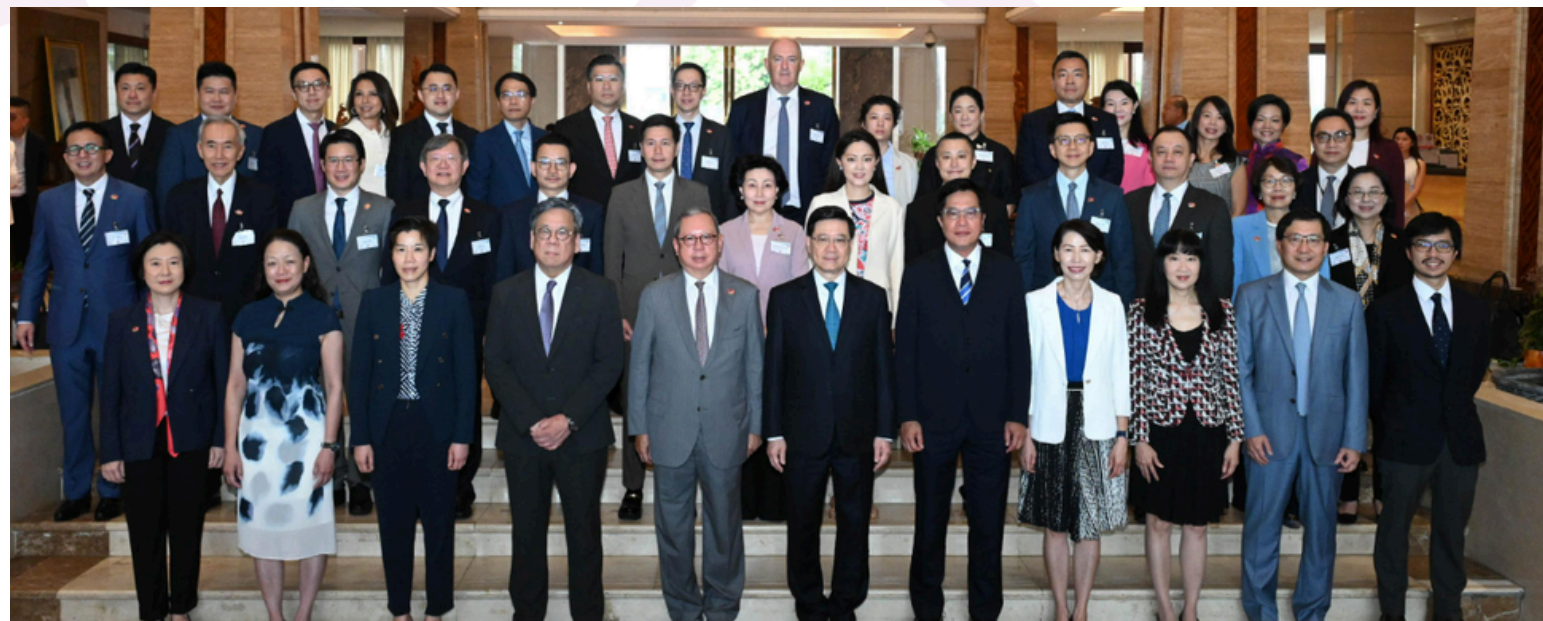
Some 30 business leaders joined the ASEAN tour.