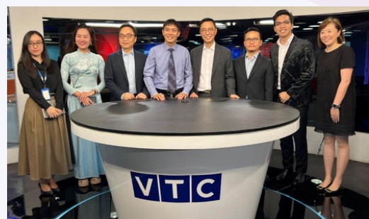
Visit to Vietnam Television Corporation.