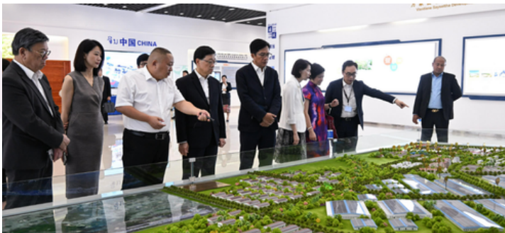
Visit to Saysettha Development Zone, a state-level co-operation project between China and Laos.

The Chief Executive John Lee led a high-level government and business delegation to . Aiming to highlight Hong Kong's strengths and introduce latest developments to local political and business communities, the ASEAN tour was a fruitful one, with a total of 55 memoranda of understanding (MoUs) and agreements concluded in three countries, significantly enhancing collaboration in various areas including customs, innovation and technology, financial services, aviation, logistics, education, tourism, investment promotion, trade and economic partnership. Apart from calling on local government leaders and attending business luncheons and dinners, he also visited key Belt and Road infrastructural developments and a secondary school in Laos, and a Hong Kong garment manufacturer in Vietnam.