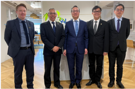
Visit to Singapore Academy of Law to discuss the development of lawtech and potential co-operation.