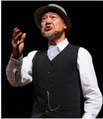
'King Li, the final escape'