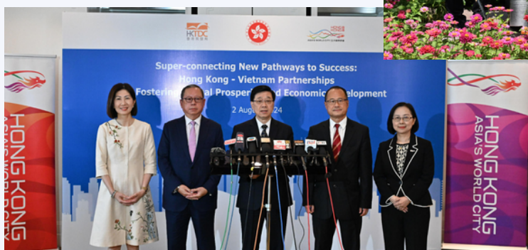
Media stand-up briefing in Ho Chi Minh City to summarise the outcome of the visit.