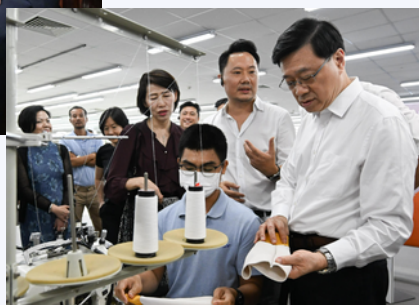
Visit to Tessellation Binh Duong, a garment manufacturer headquartered in Hong Kong (upper photo), and participating in a tree-planting ceremony (lower photo).