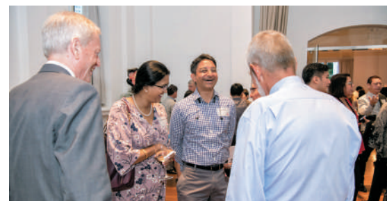
Guests at the opening