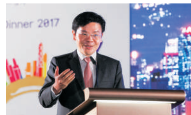
Singapore’s Minister for National Development and Second Minister for Finance, Mr Lawrence Wong