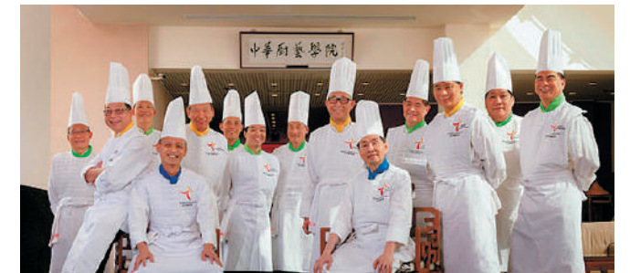
Hong Kong-style “Poon Choi” and traditional food of Hong Kong was another highlight presented by the Chinese Culinary Institute of Hong Kong.