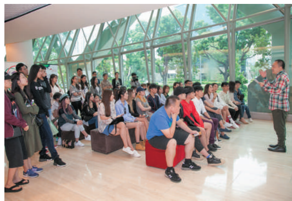
The art group took the initiative to reach out to the public by organising exchange and appreciation workshop session.