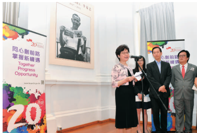
The Chief Executive, Mrs Carrie Lam, officiates at the opening.