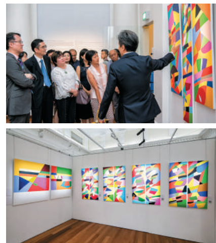
Opening of visual art exhibition “Joy to the Words”

The Opening Reception, held on July 21 at The Arts House, Singapore, was warmly welcomed by some 100 HKETO friends from the diplomat, arts, media and business circles, as well as Hong Kong communities.