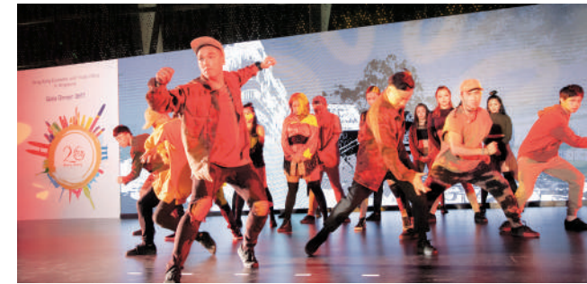
The stunning energy-filled “Danz Up 2.0”, presented by Hong Kong Arts Festival, featuring some 20 Hong Kong dancers, was the first highlight staged at the Gala Dinner with enthusiastic responses.