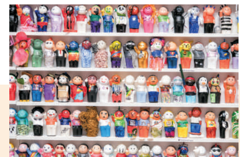
Art exhibition “Tian Tian Xiang Shang” engages people from all walks of life.

The 3-week long exhibition attracted attention of the members of the public in Singapore. Also, by engaging local primary and secondary schools and arts classes to participate, the event helped increase the ETO’s profile locally and extend the ETO’s connections with arts communities in Singapore.