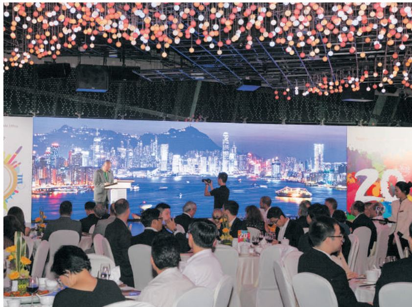
Guests at the Gala Dinner

The Gala Dinner featured Hong Kong-style “Poon Choi” and traditional food of Hong Kong presented by the Chinese Culinary Institute of Hong Kong. Many guests, especially the local Singaporeans and foreign diplomats, were impressed by the traditional “Poon Choi”, which is new to most of them. The entire programme of the dinner, together with official promotional videos playing in the background, successfully showed to our guests various facets of Hong Kong and raised Hong Kong’s profile. The event showcased the strengths of Hong Kong as a dynamic Asia’s world city, and strengthened our connections with local contacts.