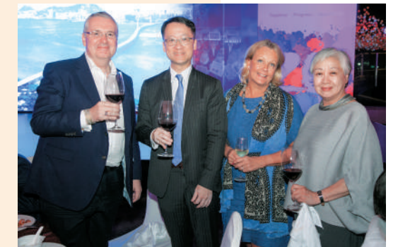
Guests enjoying at the Gala Dinner