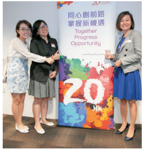
Guests enjoying their mingling at the pre-dinner reception