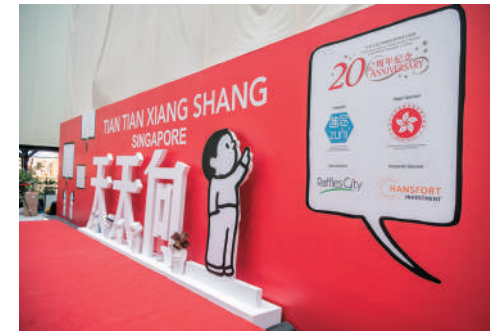
Art exhibition “Tian Tian Xiang Shang”

The HKETO in Singapore, in collaboration with Zuni Icosahedron, presented the “Tian Tian Xiang Shang” project exhibition showcasing conceptual comics “Tian Tian” in Singapore in form of mall museum in public areas inside the mall and right outside the mall entrance of Raffles City, Singapore from July 28 to August 21.