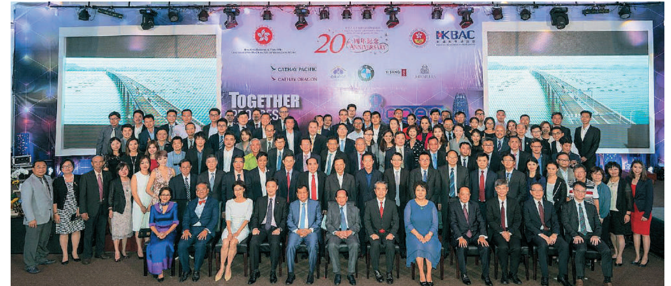
A group picture of attending guests

Some 200 representatives from the China Hong Kong & Macau Expatriate & Business Association of Cambodia and the Hong Kong Business Association of Cambodia, with support from the HKETO in Singapore, came together to celebrate the 20A of the HKSAR establishment at Topaz restaurant, Phnom Penh, Cambodia on August 10. Connecting Hong Kong people, the event aimed to continuously explore new connections and opportunities in Cambodia.